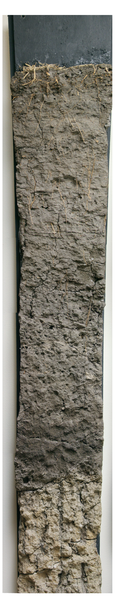
Figure 2. Soil profile from the wheat-growing area of the Pacific Northwest.

how quickly we need the results, and the cost of computer time. We upload the data to the supercomputing facility for analysis, and then sit back and wait for the results to come back.