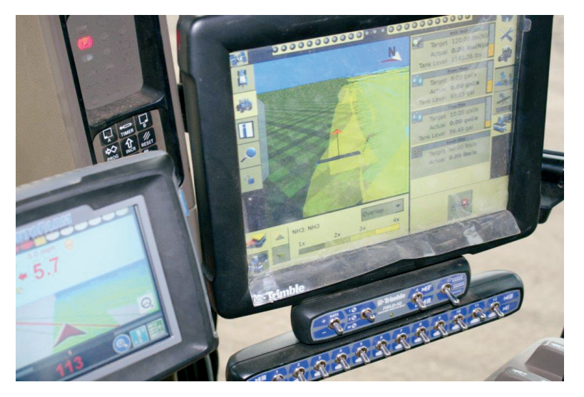
Figure 2. An example of precision agriculture software used in the field. The Trimble FmX controller (screen on right) can independently control the application rate of up to four products. Raven Envizio Pro (smaller screen on left) carries out auto-steering and provides guidance.

A public-private partnership would reduce the "respondent burdens" associated with the present system of multiple mailbased and personal interview surveys used to collect data periodically from growers and landowners (such as the National Resources Inventory and the Census of Agriculture). Under an integrated system, much of the baseline information could be acquired and stored once, as a part of a farm operation's ongoing management system, rather than being collected multiple times for multiple purposes. This information could be updated in a more cost-effective way, through mobile or web-based technologies. Such partnerships would minimize the duplication of data collection efforts and costs, making science-based policies and precision agriculture more economically feasible.