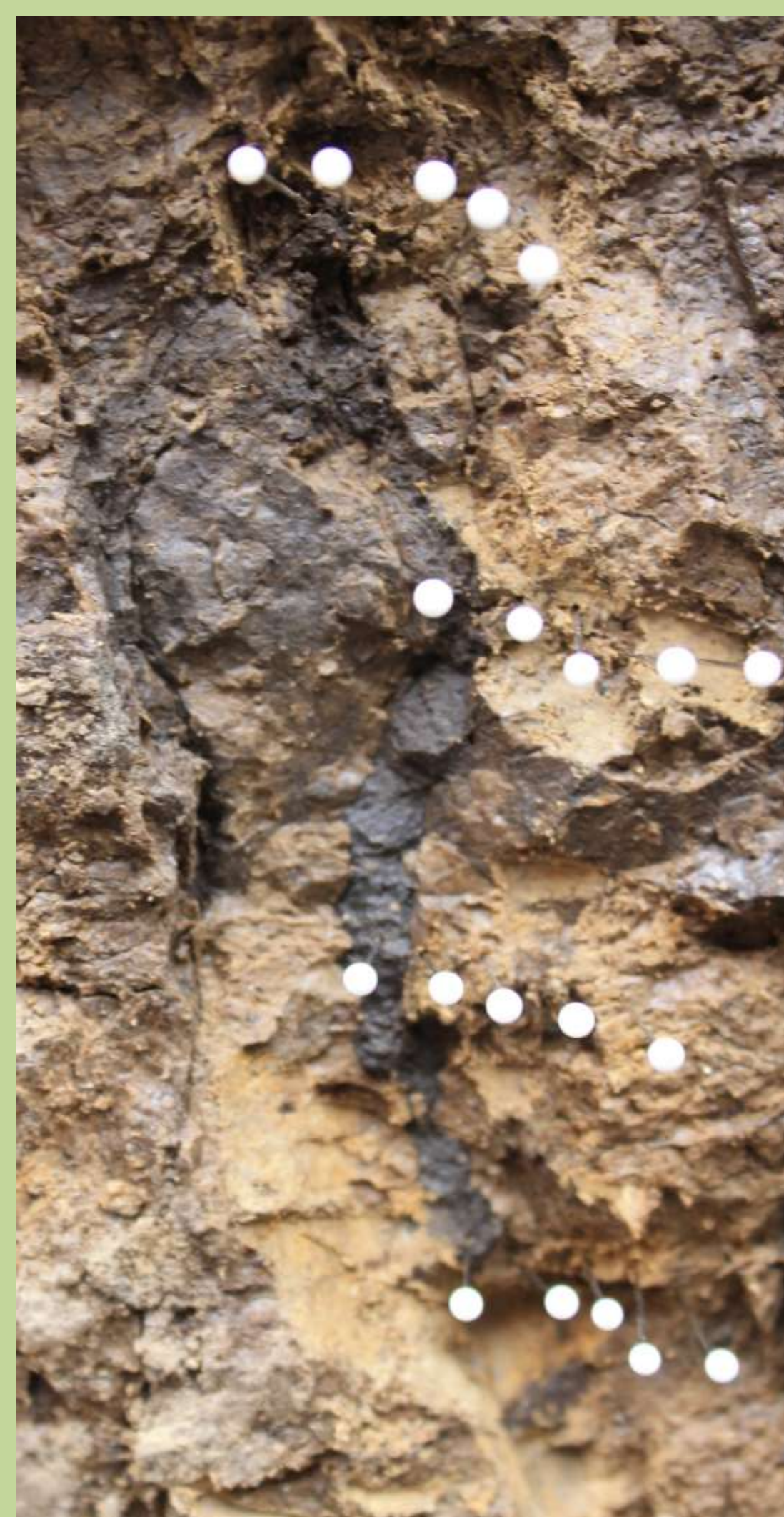
1.5 mm pin heads