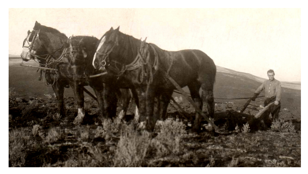
Fred Fleming's great uncle Herman Wagner first broke the ground on the family's spread in the late 1800s with a moldboard plow. The practice resulted in erosion. Today Fleming is rebuilding his soil with no-till practices that directly plant seeds into the ground.

Coming up to an operating tractor, Fleming notes that only three or four passes are required annually – spray, fertilize, seed. Two involve no soil interference at all. That contrasts with eight to 12 passes before – plowing, chiseling, spring harrowing, cultivating, fertilizing, seeding, weeding, smoothing ground. He estimates a 42% fuel savings, which is "why a lot of farms have adopted no-till." Fertilizer application is variable, and computer controlled. "By using precision ag we are