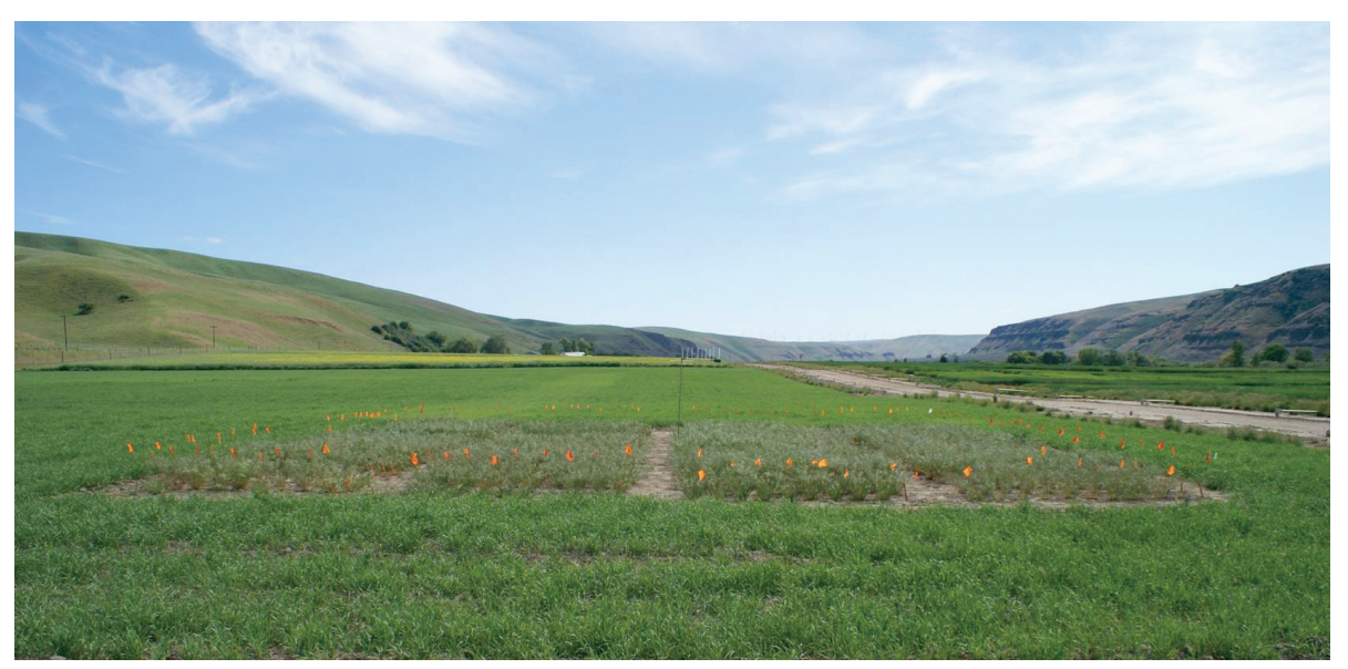
Figure 3. Downy brome common garden.