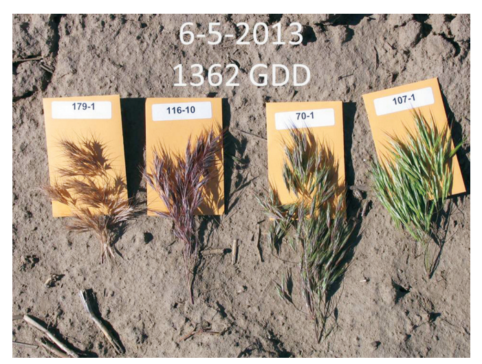
Figure 1. Downy brome variation in the Pacific Northwest.

advanced 10 to 30 days, depending on the model used. When models were averaged, the projected date advanced 15 to 25 days, depending on location. The projected calendar date to reach 1,000 GDD follows an east-west gradient across the projected region in all models. The eastern region of small grain production in the PNW is projected to have the least change, while the western region is projected to have the greatest advance in calendar date needed to reach 1,000 GDD.