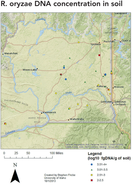
Figure 3. Map showing concentration of DNA of Rhizoctonia oryzae in soils across eastern Washington (grower fields and variety testing sites), sampled in 2006–2008.

the roots of grassy weeds and volunteers. When these weeds are treated with glyphosate prior to planting, the fungus can grow on the dying weeds and build up to a high level. This is because the fungus can grow on both living and dead tissue. If the crop is planted into these dying plants, the fungus will bridge over to the young wheat or barley seedlings; hence the name "green bridge." But if a sufficient time is allowed for the weeds to die before planting, the pathogen population cannot survive well, and damage is reduced. This interval should be at least 2 weeks, preferably 3 weeks.