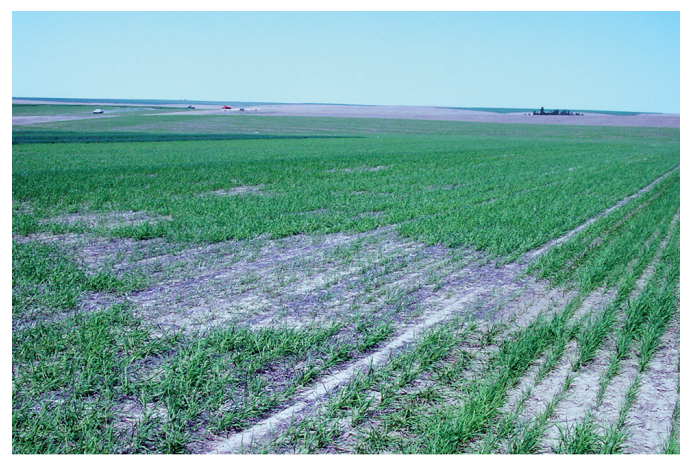
Figure 1. Rhizoctonia bare patches in spring wheat, Ritzville, Washington.

How can growers manage this disease? They have two sets of tools in the toolbox—cultural and chemical. For cultural control, reduction of the green bridge is essential, especially for spring wheat. Rhizoctonia and other soilborne pathogens also grow on